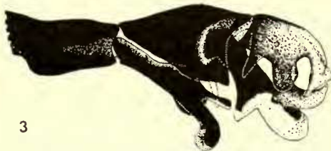
FIG. 3. Boettcherisca (Coeisca) khasiensis S.W., Phallosome.

EAST NEPAL: Taplejung Distr., edge of mixed forest above Sangu, c. 6,500 ft, 17.x–1.xi. 1961, 1 ♂.